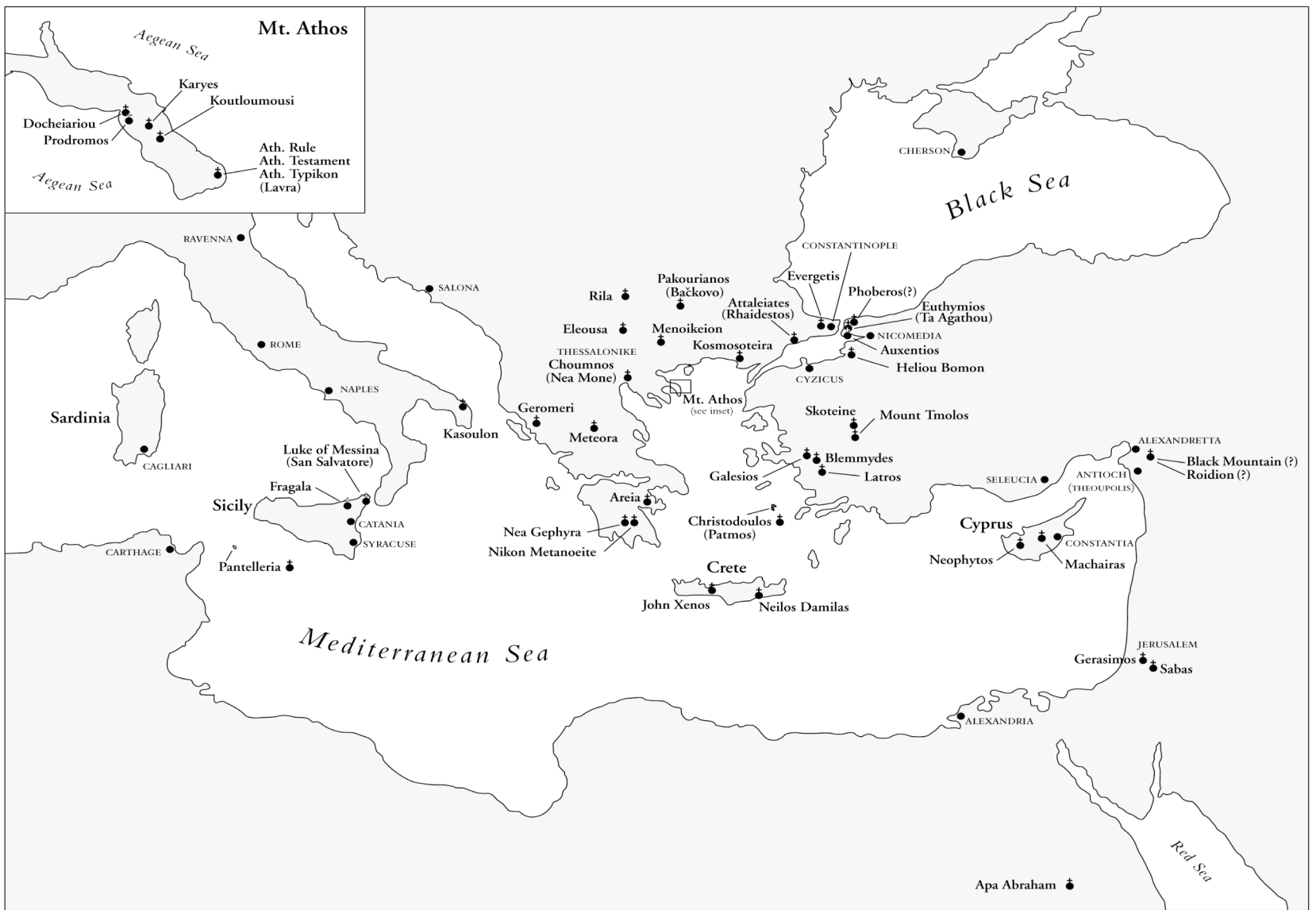
Sites of monasteries for which typika (☩) survive are indicated by the abbreviated references used for the documents in this volume. A question mark (?) indicates an approximate location. Athanasios I, Constantine IX, Manuel II, and Tzimiskes were written for all the monasteries of Mount Athos.