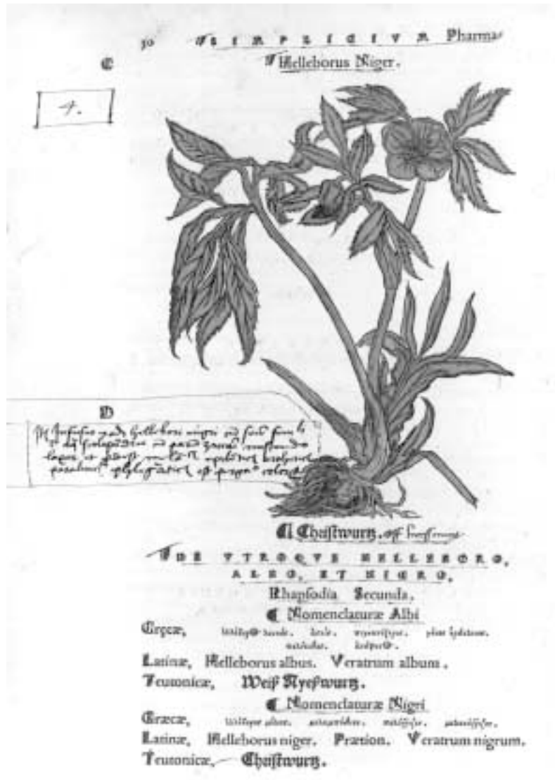
Woodcut from Otto Brunfels, Herbarum vivae eicones , 1530, in the exhibition, Ancient Botany from Byzantium to the West