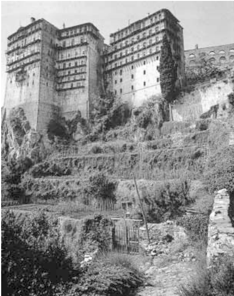
Terraced gardens at the monastery of Simonopetra, Mount Athos, from Byzantine Garden Culture