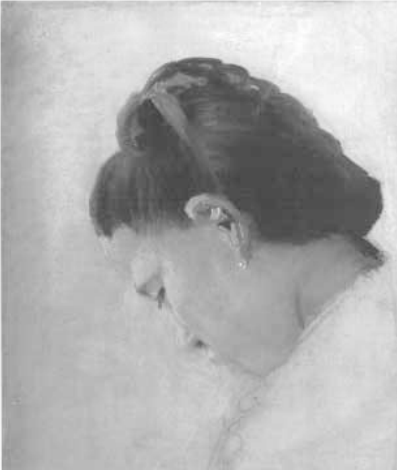
George Seurat, Head of a Young Girl , loan from the collection for the exhibition, George Seurat, 1859–1891 , at the Metropolitan Museum of Art, New York