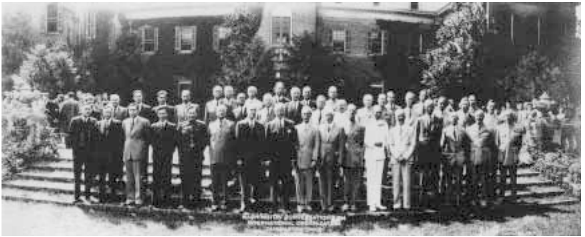
Delegations representing the United States, Great Britain, and the Soviet Union assembled for a photograph on the north lawn of Dumbarton Oaks (from The Dumbarton Oaks Conversations and the United Nations, 1944–1994 ; photo courtesy of the National Archives, Washington, D.C.)