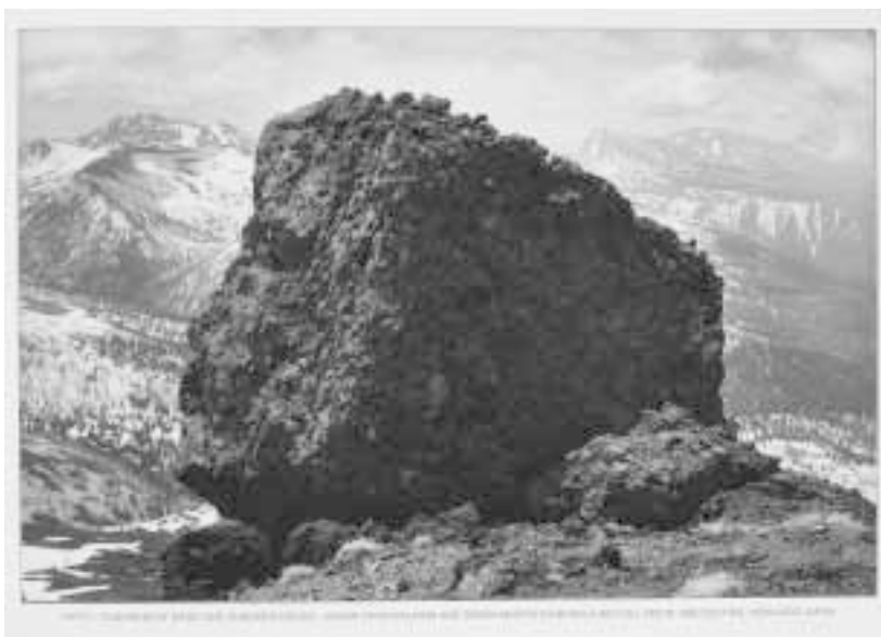
Photograph from Hamish Fulton, Walking Passed, Standing Stones, Cairns, Milestones, Rocks and Boulders , in the exhibition, Shifting Perspectives in Landscape Architecture and Garden Art in England