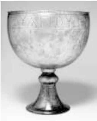
Silver liturgical chalice with engraved inscription, from the Kaper Koraon Treasure, Syria, sixth century

The Lovers Lane Pool, which had not held water for about eight to ten years, was restored.