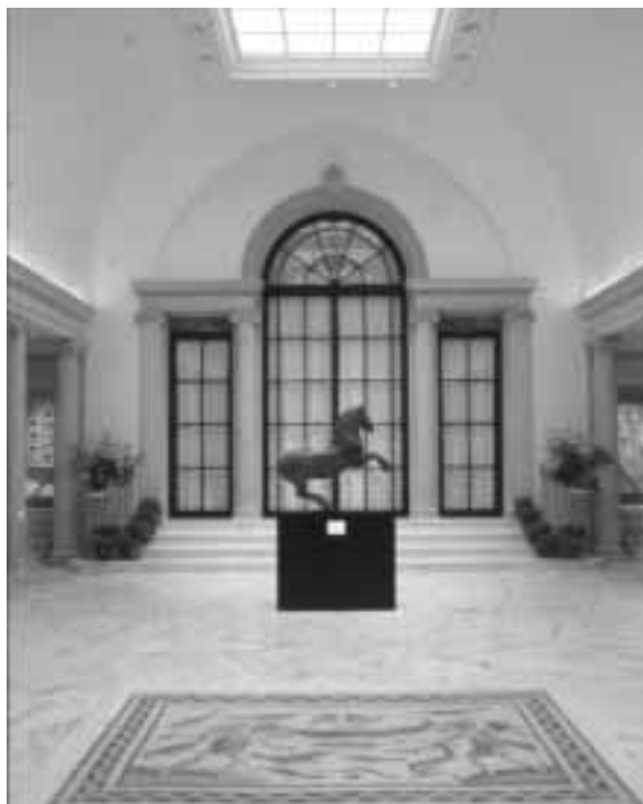
Byzantine Courtyard Gallery

At the Administrative Committee meeting on December 15, 1989, the committee agreed to disband the Dumbarton Oaks Board of Advisors.