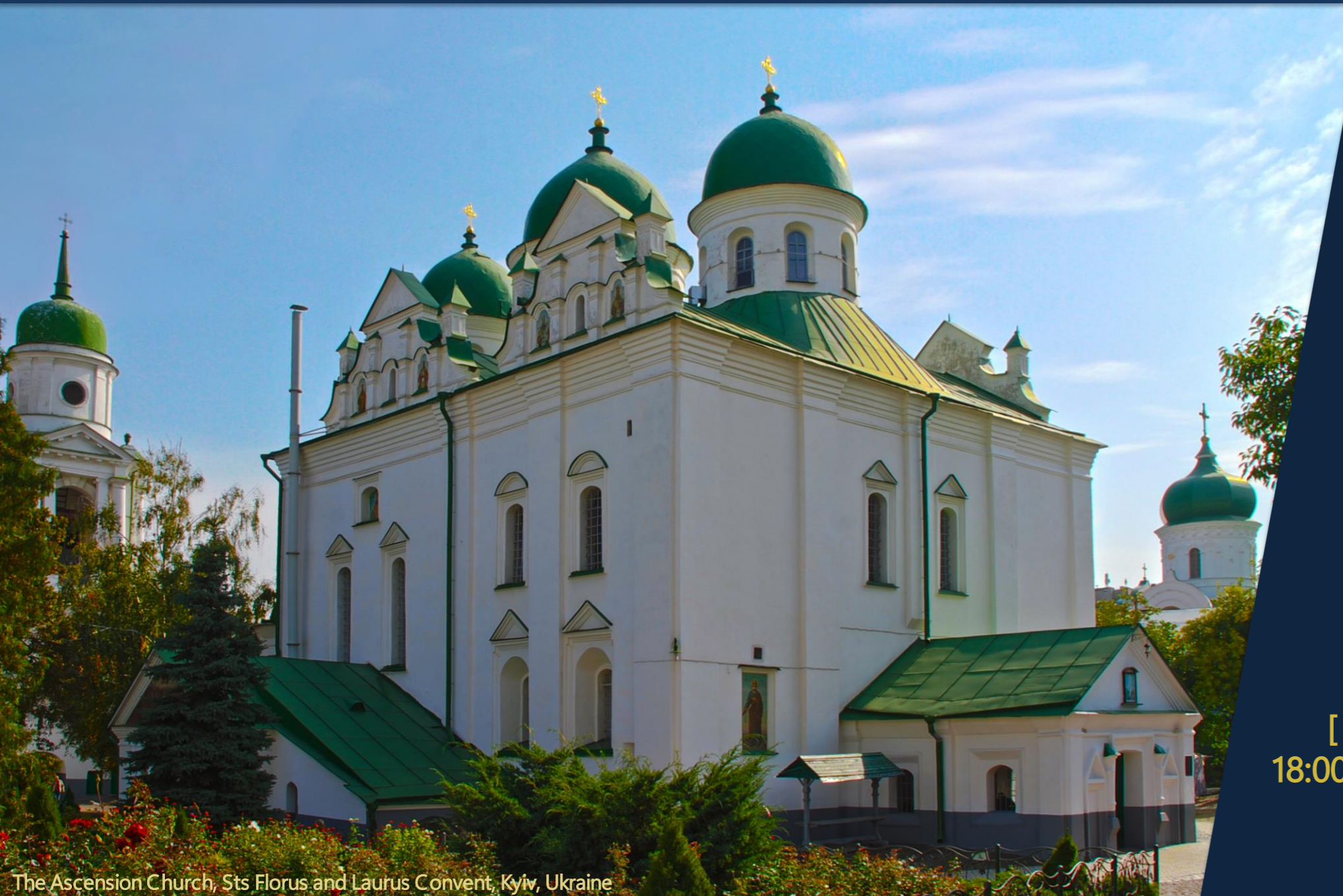
The Ascension Church, Sts Florus and Laurus Convent, Kyiv, Ukraine

PRESENT: Virtual Conversations on History, Art, and Cultural Heritage