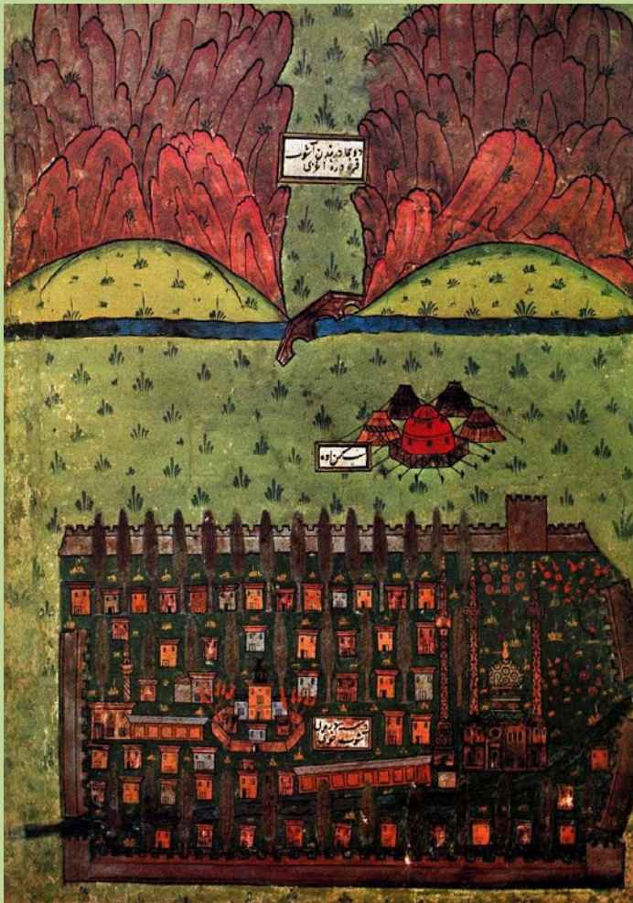
Khoy with its gardens and surrounding landscape. Circa 1533, Iran. Artist: Matrakçı, ūhū Silāhū.

The Garden and Landscape Studies program at Dumbarton Oaks is pleased to share with you the following announcements regarding 2009-10 fellows, fellowship applications, new staff, new programs, forthcoming lectures and symposium, and new publications.