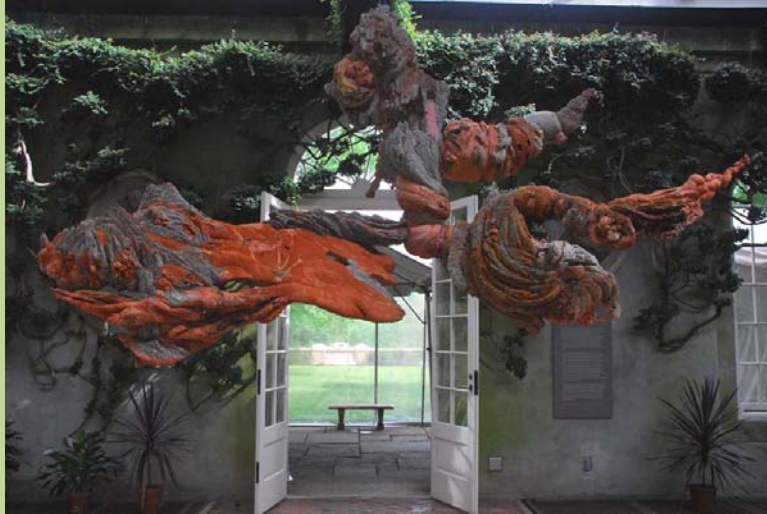
Mental Earth , 2003

GLS has also initiated an occasional series of temporary installations of contemporary art and design under the direction of John Beardsley. The first project, by the sculptor Charles Simonds, was installed in late April and opened on May 8 during the 2009 symposium. Titled Landscape/Body/Dwelling , the installation featured clay sculptures in the gardens and museum and an installation of archival material, including books and films, outside the rare book room. Much of the work revolved around the artist's fantasy of an imaginary civilization of little people and his exploration of the analogies among the earth, the body, and architecture, all of which he conceptualizes as different sorts of dwellings. The exhibition received a full-page, very favorable review in the Washington Post Weekend section on June 11, 2009 ( http://www.washingtonpost.com/wp-dyn/content/article/2009/06/11/AR2009061101332.html ), and will be reviewed in Artforum in October. The exhibition runs through October 25, 2009.