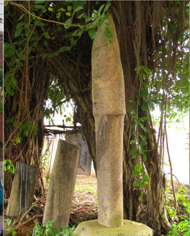
Ogun Mogun Shrine, Nigeria

Cities of the Yoruba of southwestern Nigeria and adjacent Benin Republic often feature densely crowded, almost maze-like thoroughfares, neighborhoods, and residential compounds, consistent with urban centers dating back in some cases to the early fourteenth century C.E. and today housing populations that often reach the millions. Less well known in these same cityscapes is the rich and complex role that landscape plays within each city highlighting the ritual primacy of place, history, and belief within each locality and among the Yoruba more generally. Envisioning landscapes of the past is often a difficult task, particularly in contexts for which there are few if any written documents. This lecture will also address the ways in which GIS and a new website at Harvard University called Worldmap ( worldmap.harvard.edu ) provide the means to begin to access an array of data about landscape symbolism and use in both the past and the present.