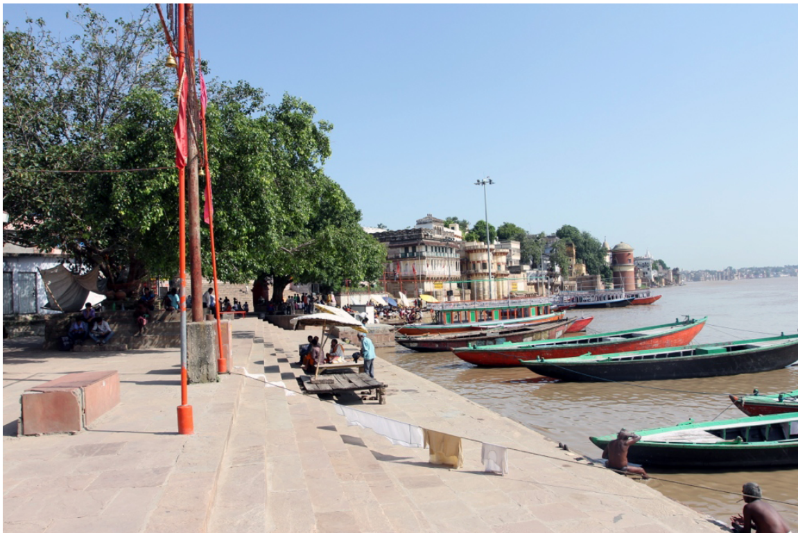
Assi Ghat at Varanasi, India.

The Mellon Fellowship in Urban Landscape Studies at Dumbarton Oaks has been a remarkable experience that has allowed me to advance my research on developing a better understanding of the flexibility and socio-cultural performance of urban land-water edges in India. Very few opportunities exist for landscape architects that simultaneously provide time and space for reflection and inspiration to pursue research that can inform better designs. During my fellowship, I studied data that collected during my field studies and developed three papers. The first paper compares the ponds ( talaab ) and river edges ( ghat ) in India to synthesize aspects that enable them to act as vibrant social spaces; the second essay analyzes the role of religious architecture at the talaab water edges; and the third explores the dual role of ghat infrastructure as a hybrid object and subject in the landscape. The