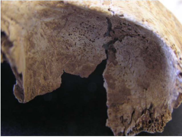
Fig. 25. Skel. 018. Cribra orbitalia