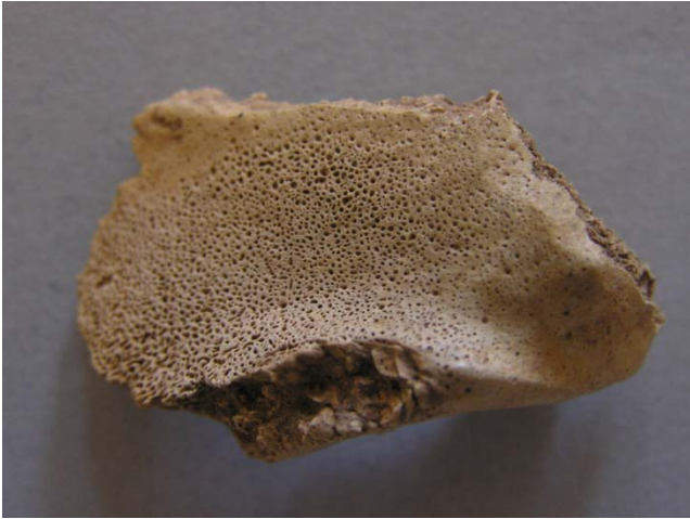
Fig. 29. Skel. 011. Porotic lesions on the sphenoid bone associated with scurvy