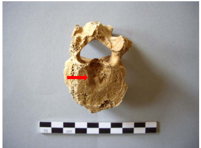
Fig. 36. Skel. 054. Discal prolapse on a lumbar vertebra