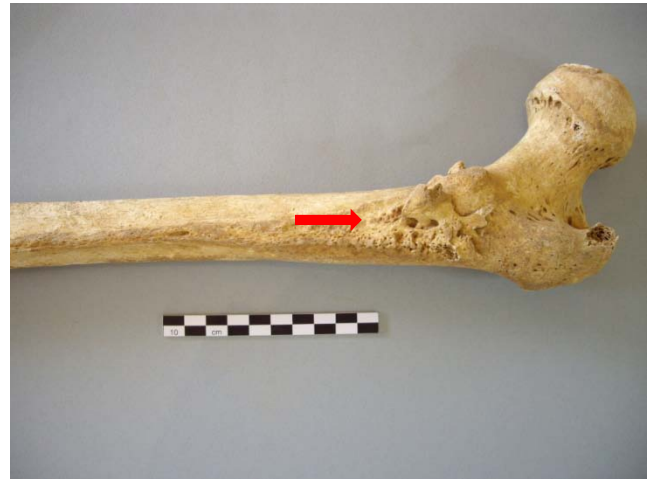
Fig. 40. Skel. 045. Myositis ossificans on proximal femur