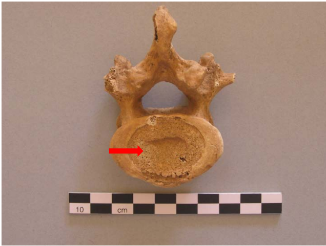
Fig. 37. Skel. 037. Schmorl' node on a lumbar vertebra