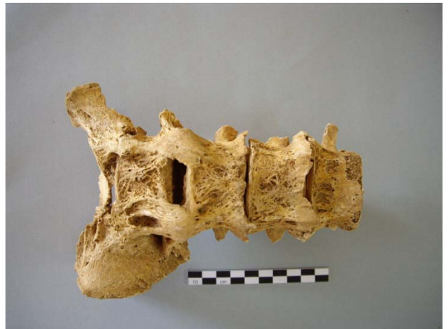
Fig. 34. Skel. 045. Ankylosis of sacrum and lumbar vertebrae