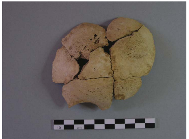
Fig. 28. Skel. 011. Ectocranial lesions associated with scurvy