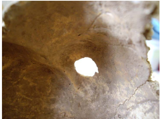
Fig. 42a, b. Skel. 040. Large perforation on the cranium (trepanation?)