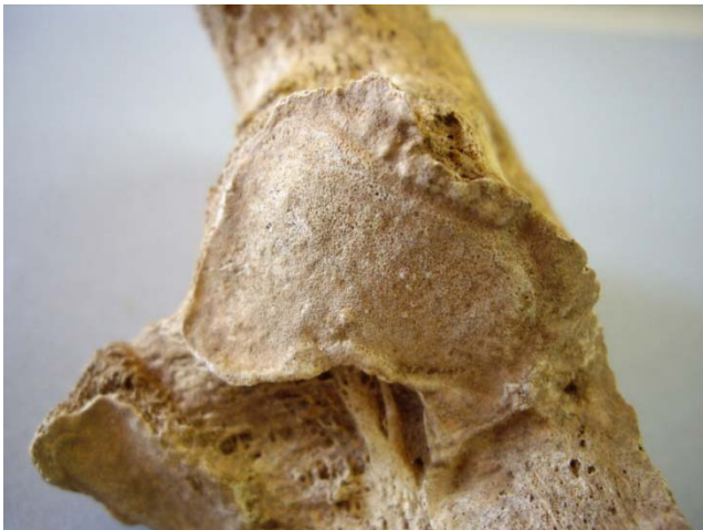
Fig. 35. Skel. 052. Osteoarthritis of tarsal bones