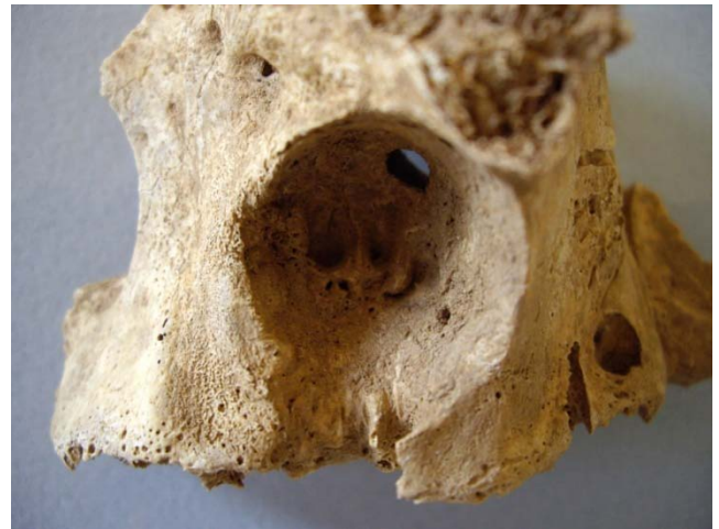
Fig. 32. Skel. 042. Massive destruction of the alveolar bone of the maxilla due to abscess