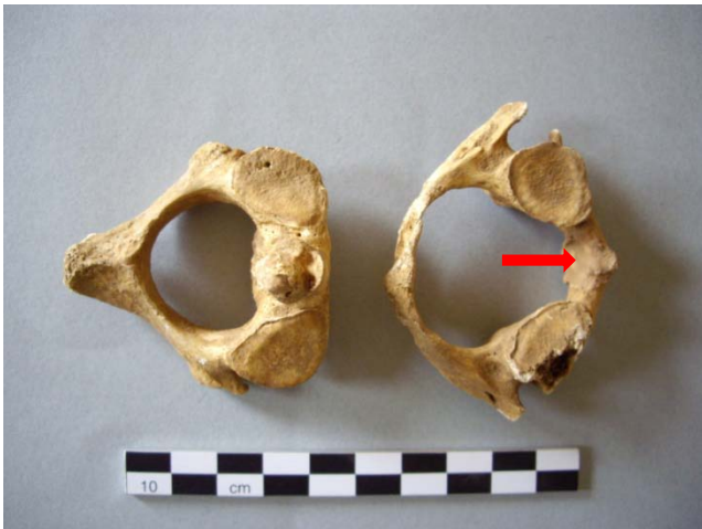
Fig. 33. Skel. 054. Osteoarthritis of cervical vertebrae