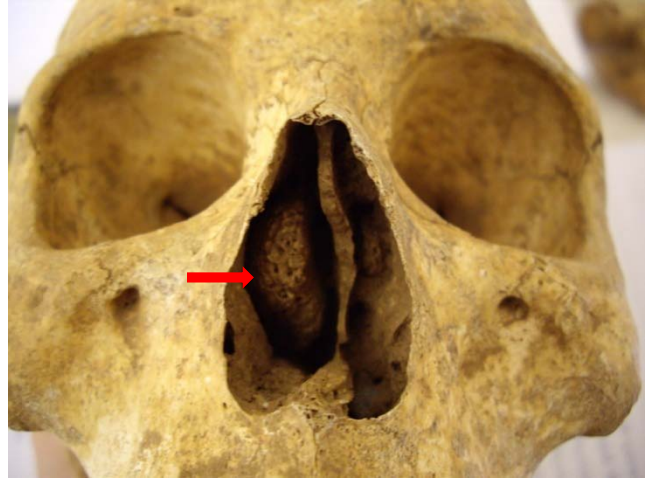
Fig. 44. Skel. 039. Osteoma of the ethmoid (?)