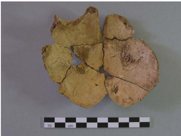
Fig. 27. Skel. 011. Endocranial lesions associated with scurvy