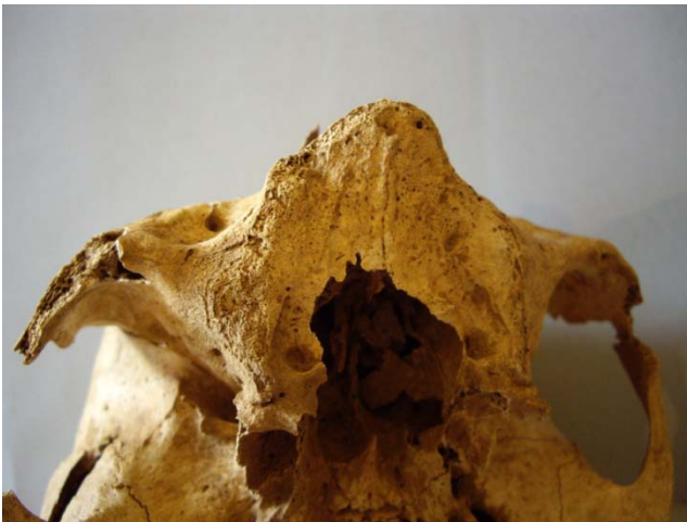
Fig. 31. Skel. 032b. Edentulous maxilla