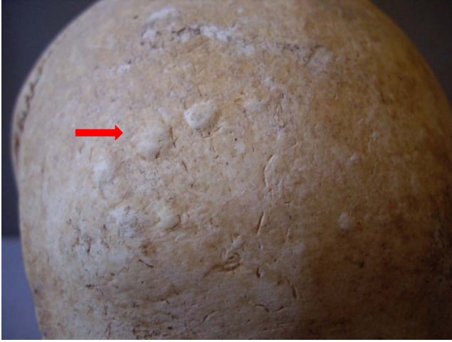
Fig. 43. Skel. 051. Button osteomas on the cranium