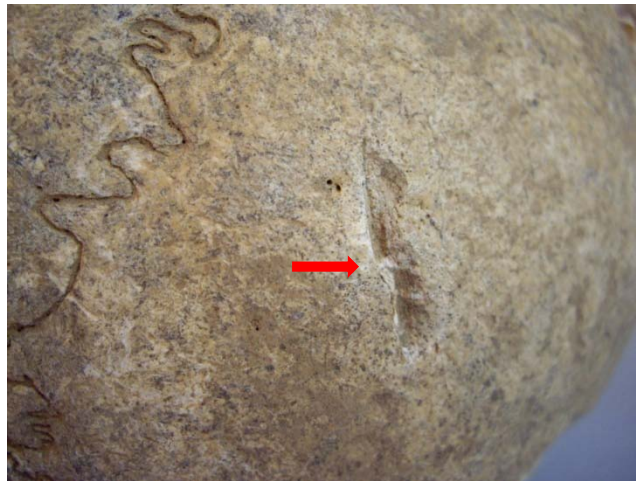
Fig. 41. Skel. 041. Cranial fracture