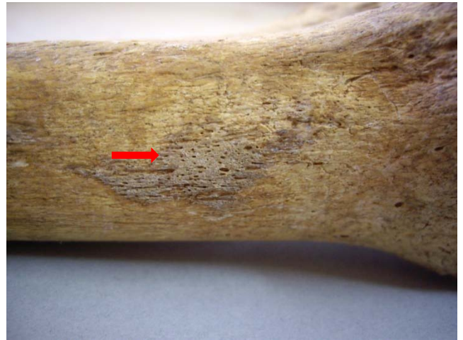
Fig. 38. Skel. 052. Periostitis on the distal tibia