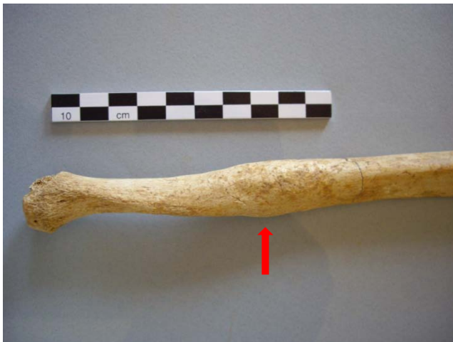
Fig. 39. 37. Skel. 043. Parry fracture in distal ulna